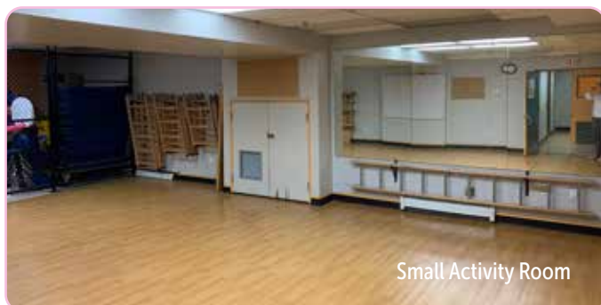
Small Activity Room